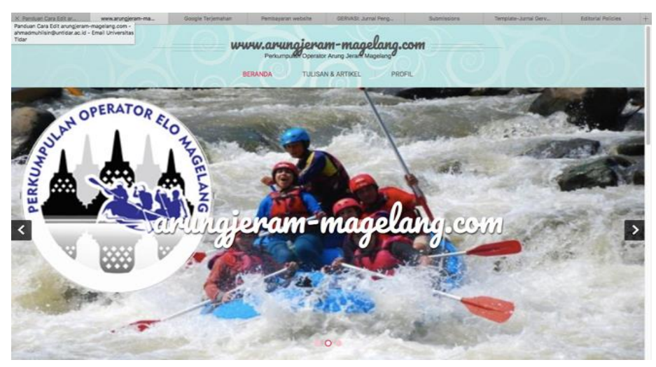
Figure 2. Integrated Website of Elo River Rafting Operator Association

The enhancement of Elo River operator association competitiveness also carried out through the development of information technology-based integrated website accessible anytime and anywhere. The integrated website contains information on the association profile, AD/ART, and general information. The integrated website of the Elo River operator association Magelang Regency is displayed in Figure 2.