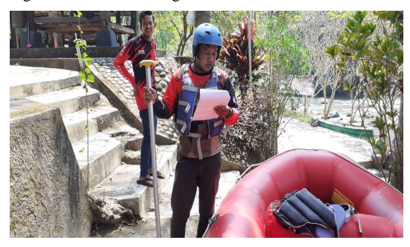
Figure 4. English Communication Simulation Activity by Tour Guides

To expedite the tour guides in practicing their English communication, the second stage was learning activity through direct practice using props and real environment simulation (in a condition of serving a tourist). The simulation activity in English is illustrated in Figure 4.