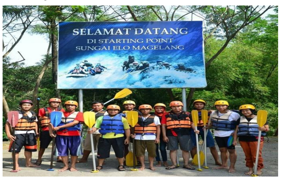
Figure 1. Starting Point of Elo River Rafting Magelang (https://www.tuguwisata.com/rafting-sungai-elo-magelang/)

The Elo River rafting tourism object is a tourism activity package that includes activity of down the Elo River along 11 km using a rafting boat. The activity starts from Blondo Bridge up to Mungkid Bridge of Magelang Regency that lasts for 2.5 hours. The Elo River is located in Magelang at Jl. Raya Borobudur KM.3, Selag, Pabelan, Mungkid, Ngaseman, Magelang, Central Java. The close proximity of the river location to Borobudur Temple brings a potential for development to support the surrounding village communities. The number of tourist in 2018 is recorded at 6.36 million that consists of 5.9 million local tourists and 350,000 foreign tourists (Katadata, 2019). The river rafting starting point is illustrated in Figure 1.