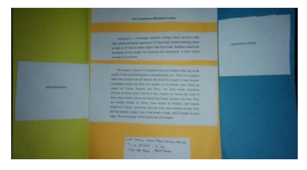
Figure 2. Inside a lapbook

Arsyad (2012:224 cited in Andyana and Ranu, 2017) states that lapbook can be adjustable for teaching purposes. To add, the selection of Lapbook is conceptually clear as it is used for result analysis. Lapbook can adjust the students' characteristics. Moreover, lapbook contains a visual