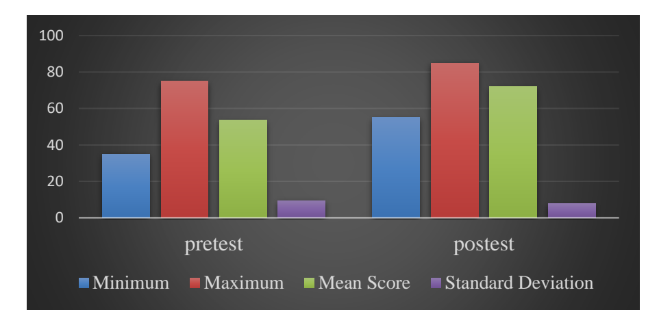
Figure 3. The descriptive statistics of the pre-test and post-test scores

In the post-test, the min score was 55 and the max score was 85. The total score for post-test was 2660 from a total of 37 students. The mean score for post-test was 71,89 and the standard deviation of the post-test was 7.670. In the process of post-test implementation, the students began understanding the questions that the researcher had given because the material was explained in the previous treatments. Figure 3 reveals the descriptive statistics of the pre-test and post-test scores.