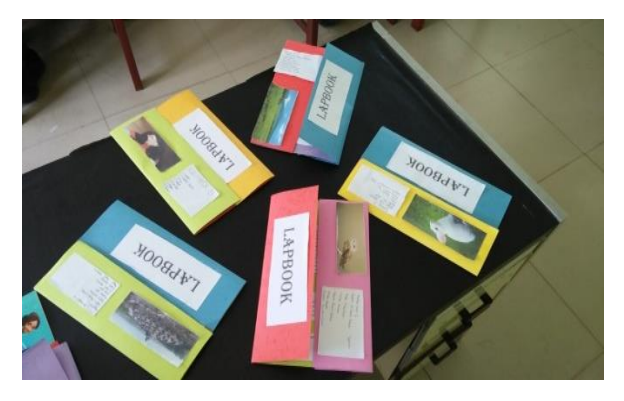
Figure 1. Front Cover of a lapbook

The students' work from each group is detailed in the following pictures below, and The Prambanan Hinduism Temple is the teaching topic. Here, the students enjoyed the learning process.