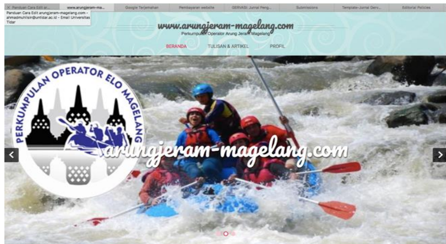
Figure 2. Integrated Website of Elo River Rafting Operator Association

The enhancement of Elo River operator association competitiveness also carried out through the development of information technology-based integrated website accessible anytime and anywhere. The integrated website contains information on the association profile, AD/ART, and general information. The integrated website of the Elo River operator association Magelang Regency is displayed in Figure 2.