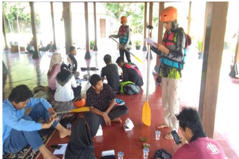
Figure 3. Indoor English Training using Props

Communication skill training especially English was intended for tour guides so they could provide amenities for both local and foreign tourists. The training was an applicative-based training instead of a theoretical training. The purposes were to have the tour guides understand and practice sentences needed in daily life. The activity was generally divided into two stages. The first stage was indoor learning stage using props in group. The indoor training is depicted in Figure 3.