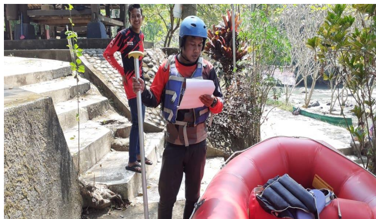
Figure 4. English Communication Simulation Activity by Tour Guides

To expedite the tour guides in practicing their English communication, the second stage was learning activity through direct practice using props and real environment simulation (in a condition of serving a tourist). The simulation activity in English is illustrated in Figure 4.