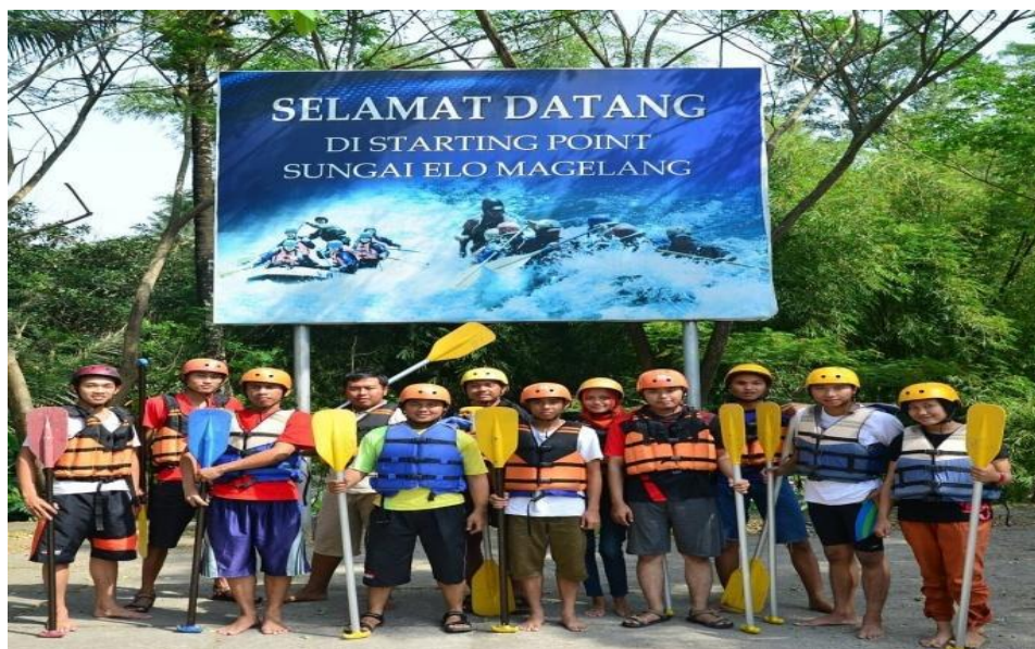
Figure 1. Starting Point of Elo River Rafting Magelang ( https://www.tuguwisata.com/rafting-sungai-elo-magelang/ )

The Elo River rafting tourism object is a tourism activity package that includes activity of down the Elo River along 11 km using a rafting boat. The activity starts from Blondo Bridge up to Mungkid Bridge of Magelang Regency that lasts for 2.5 hours. The Elo River is located in Magelang at Jl. Raya Borobudur KM.3, Selag, Pabelan, Mungkid, Ngaseman, Magelang, Central Java. The close proximity of the river location to Borobudur Temple brings a potential for development to support the surrounding village communities. The number of tourist in 2018 is recorded at 6.36 million that consists of 5.9 million local tourists and 350,000 foreign tourists (Katadata, 2019). The river rafting starting point is illustrated in Figure 1.